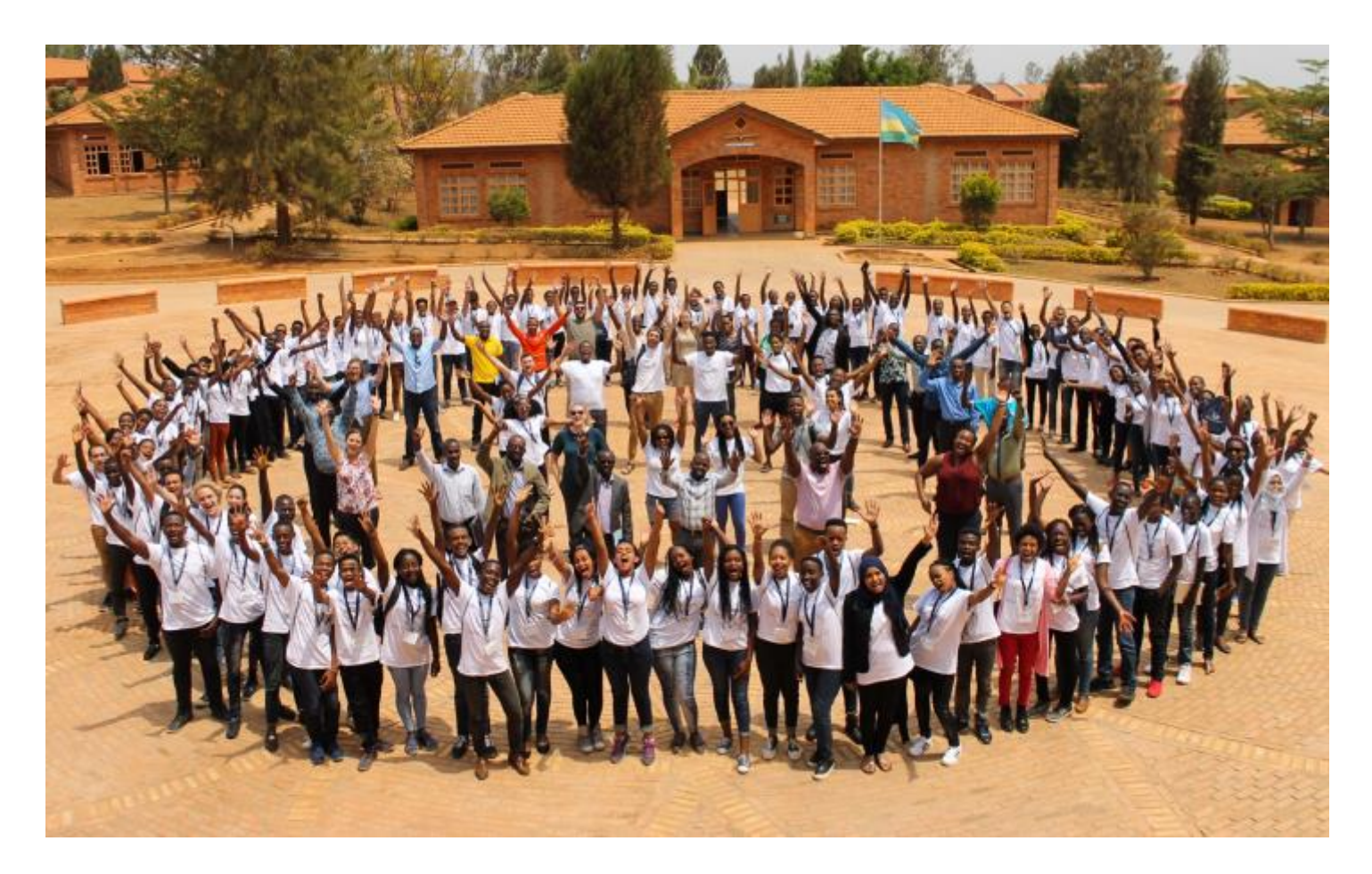
Yale Young African Scholars is an official program of Yale University.